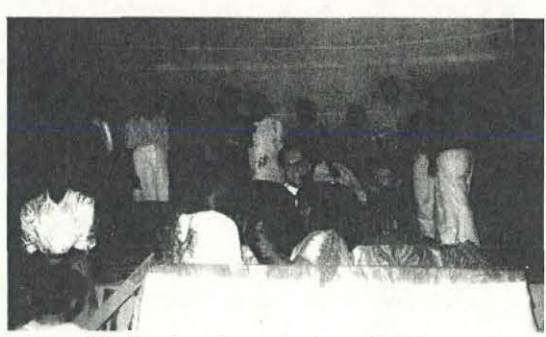
One of the baptismal ceremonies at Keila's meetings