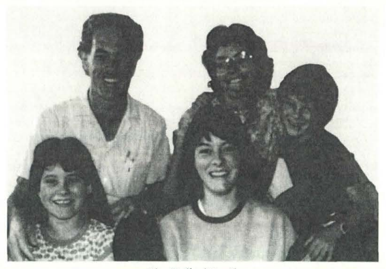
The Stafford Family