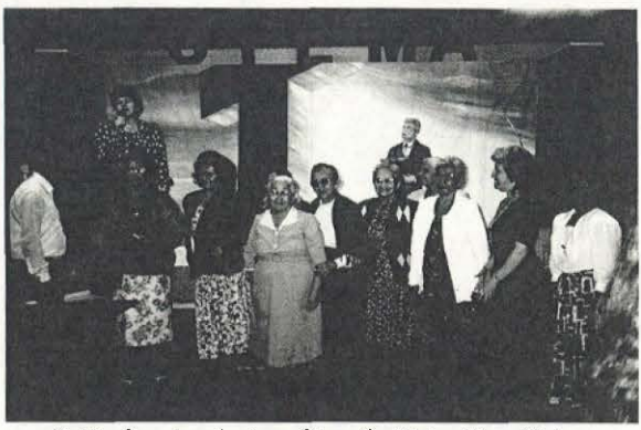
Retired pastoral wives from the Colombian Union receive special recognition

ference, in Tashkent, hosted a meeting for pastoral wives, and 12 attended. The women from Tadzhikistan and Turkmenistan could not come because of political events and the fact that there was no transportation connection. Please remember these pastoral wives in your prayers. Those who attended exchanged souvenirs