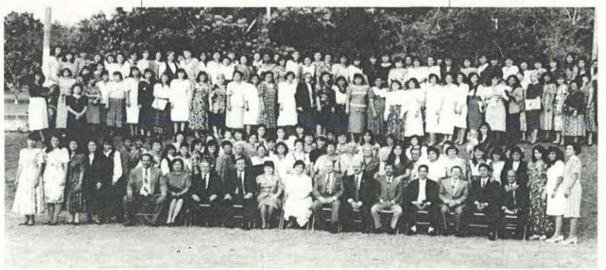
Colombian Union pastoral wives and Union leaders

This exciting magazine is full of variety-entertainment, craft ideas, puzzles, and pictures to color. There are riddles and a special "Nature Nook." PKs are challenged to stretch their minds in "Quiz