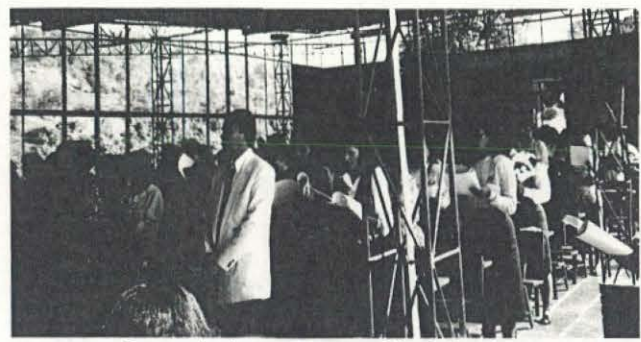
Pastoral wives enjoying Sabbath Services