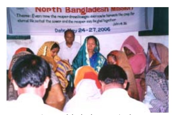
A group of shepherdesses praying for bereaved families