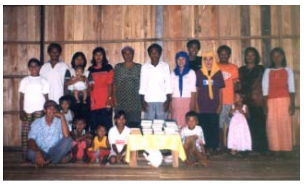
Baptismal candidates at Kinatal Island