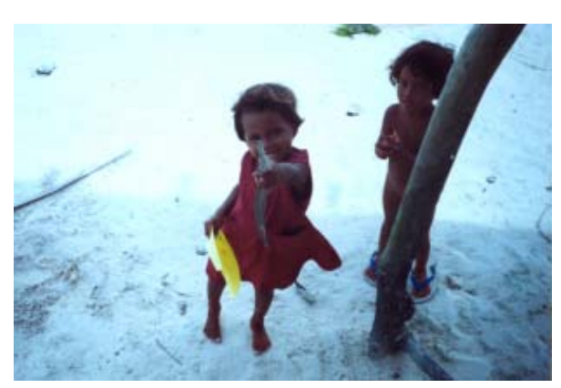
A smiling Badjao girl sharing her newly caught fish.