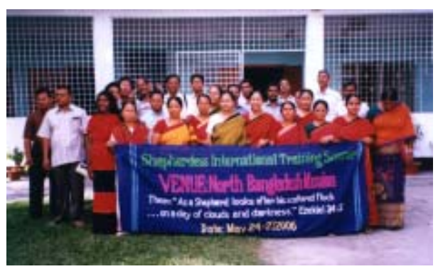
Shepherdess Training Seminar held at North Bangladesh Union Mission

Bangladesh Union Mission: On May 24-27, 2006, the North Bangladesh Union Mission held a Shepherdess training seminar. Attendance and participation were wonderful. The Shepherdesses are willing to do extra work for the Lord, and they are encouraged and very active. Below are some pictures of their events: