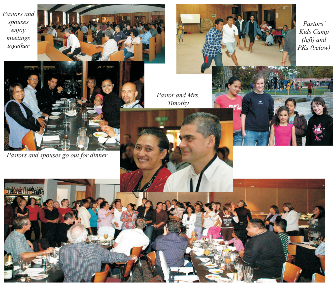
The ladies give a response during the meetings

The pastors' wives (including one brave male) had a separate meeting where they spent time getting to know each other personally. The spouses voted unanimously to have the same format for the ministers' meetings next year. One pastor went so far as to suggest that he would be happy to pay part of the cost from his wages if the same thing was done next year.