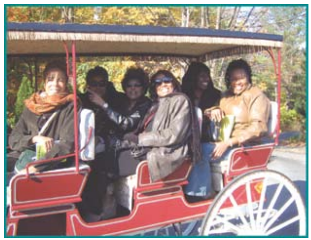
On Sunday morning, Shepherdess retreat attendees enjoyed a horse-drawn carriage ride