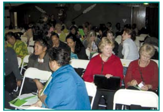
Pastors' wives in New Zealand enjoying meetings