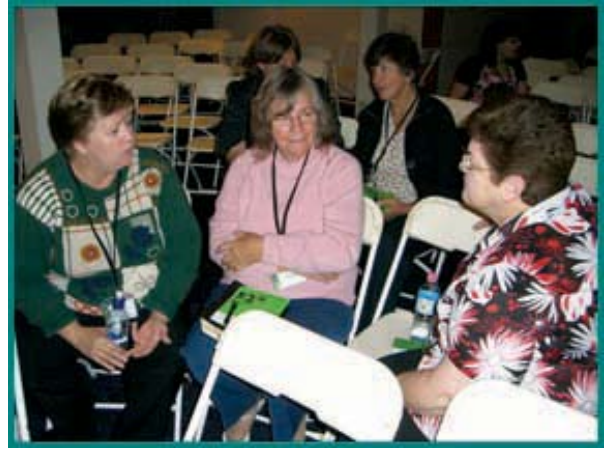
Taking a break to review notes