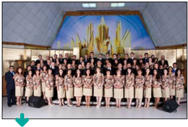
Chile Union pastoral couples.

In February 2012, 260 pastoral couples met for a ministerial assembly in Santiago with the theme of "Ministering in the Presence of the Lord." Pastors and wives searched for revival and reformation through the Holy Spirit to aid them in fulfilling the mission of a great reward in heaven.