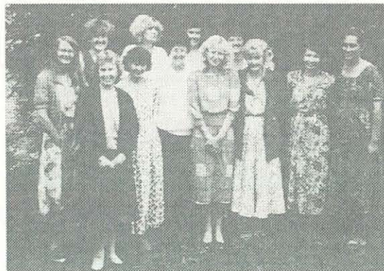
Pastoral wives at Tui Ridge in New Zealand

❖ Nearly a dozen pastoral wives from the two New Zealand Conferences met together for four days at the Tui Ridge camp near Rotorua on the North Island. Fellowship and discussions on raising children in the pastoral home