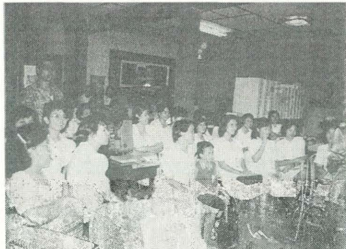
Central Luzon Conference wives attend seminar.