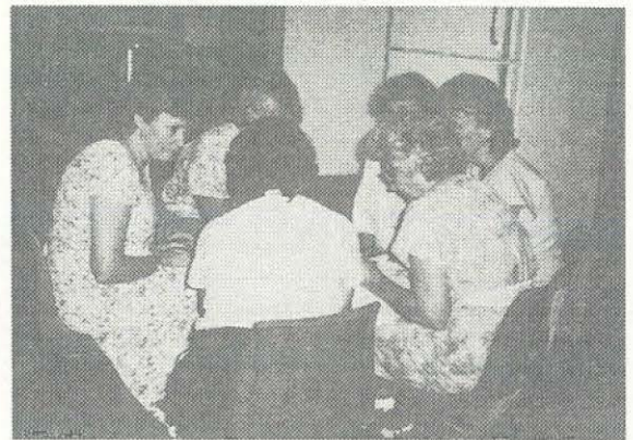
Discussion groups meet at Yarrahappane.

❖ Over 50 pastoral wives, from the Trans-Tasman Union, came together for fellowship at the Yarrahappanne church camp on the beautiful shores of the Pacific Ocean in Australia. A report on what Shepherdess International is doing worldwide was presented. The women appreciated time for fellowship and discussion on the benefits and