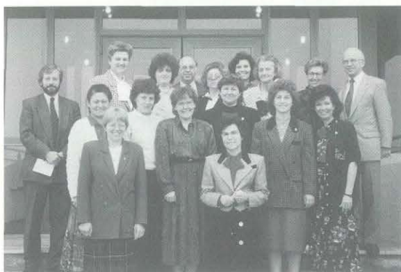
Euro-Africa Shepherdess coordinators at Collonges

Union held either an evangelistic outreach meeting or Revelation Seminar, in which she did the main speaking and coordinated the program. This 100 percent participation by the Union is believed to be a first! Other reports included weekly radio broadcasts and health seminars conducted by pastoral wives. Many people in Romania have been won to Jesus because of the faithful work of these pastoral wives.