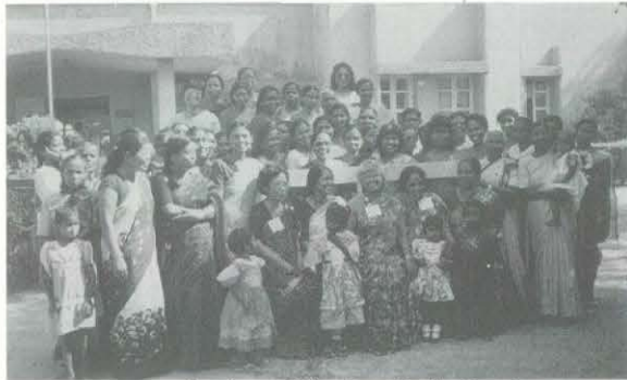
Pastoral wives of the East India Section

nated special meetings for the pastoral wives during the East India Section Constituency Meetings from March 29-April 1. Forty-three pastoral wives attended the morning meetings. They enjoyed the meetings so much that the meetings were extended to include afternoon sessions. "Parenting,"