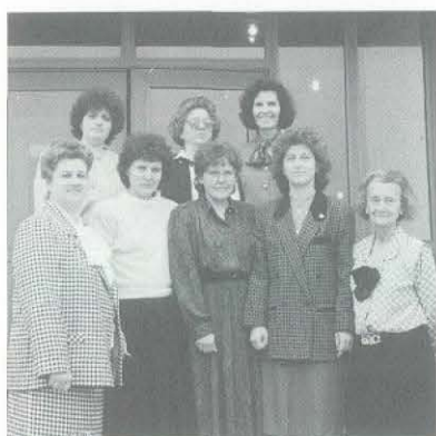
Romanian Shepherdess coordinators