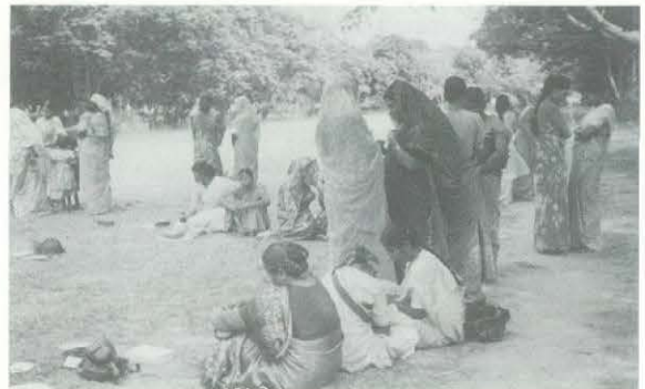
Pastoral wives of the East India Section sharing with each other

presented a seminar entitled "How to be the Best for God." There were devotionals, special songs, exercise sessions, and prayer and sharing time. The highlight of a special prayer time was when the ladies