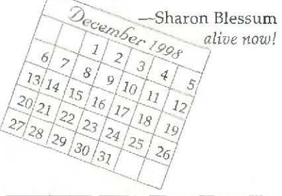
A Book of Christmas, copyright © 1988 by The Upper Room.

Between December and December we lose our way sometimes. Delours and roads not laken tantalize for sure. A star appears, ature toward truth we can hold fast, legacy from every Christmas past. Doors which were never locked are open starshine is real at mystery we kneel.