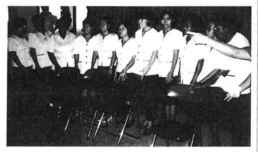
The Shepherdess group from Irian Jaya during the Shepherdess meetings in Indonesia.