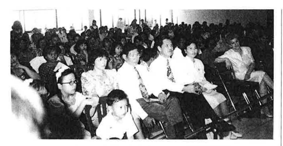
Attendance at the Manado, Indonesia evangelistic meetings