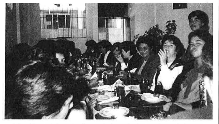
Lake Titicaca Mission AFAM (Peru Union) meet for three meetings and a banquet.