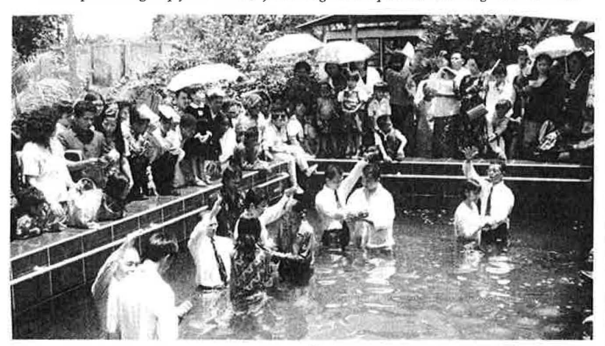
Baptism at the Union office in East Indonesia

Shepherdess Seminars were held in the mornings for all the pastors wives