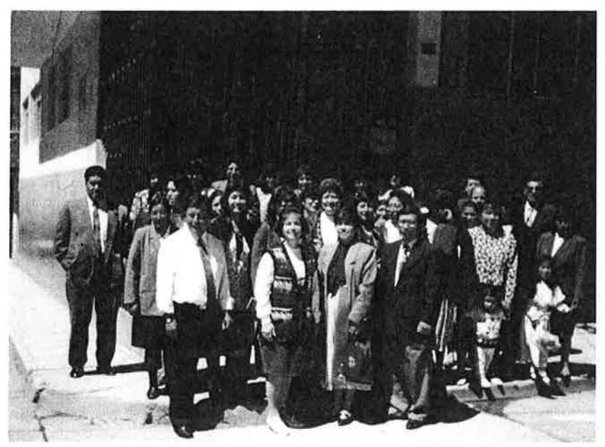
AFAM (Shepherdesses) and Lake Titicaca Mission administrators in front of the Mission office building.