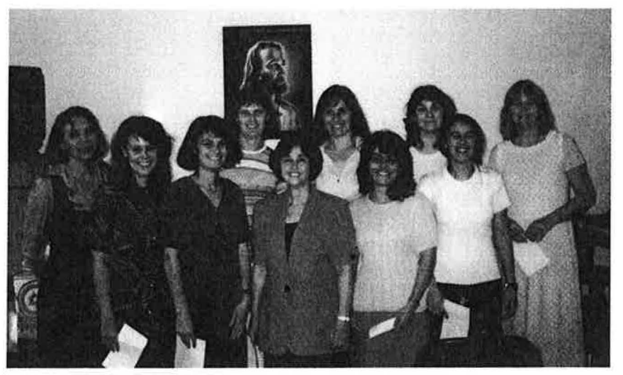
Pastoral wives from S. Catarina Mission in Brazil meet for a special day to honor their pastor/husbands.