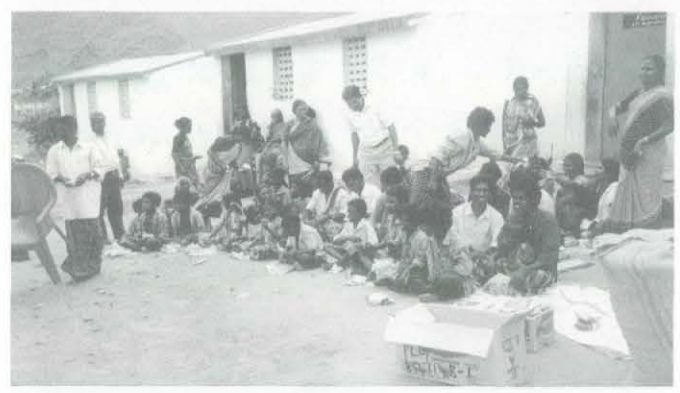
Distribution of rice, dhal and food packets to the Hill tribes.