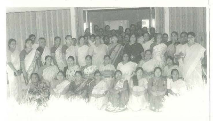
Pastors' wives who attended the Madurai Retreat.