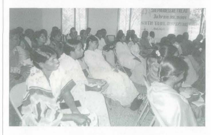
Shepherdess of South Tamil Conference, India