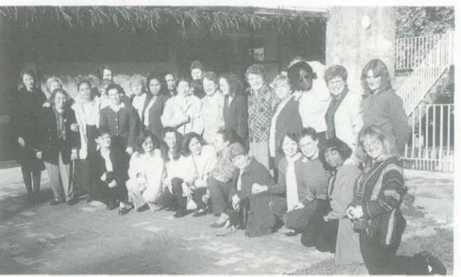
North France Conference pastors' wives at their convention.

newsletter, the "Cepapyrus" quarterly and yearly a large in clusive Journal, "Cep." Regional. All-conference meetings are usually attended by about 40 women.