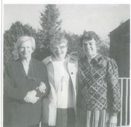
The three oldest pastors' wives in the North France Conference.