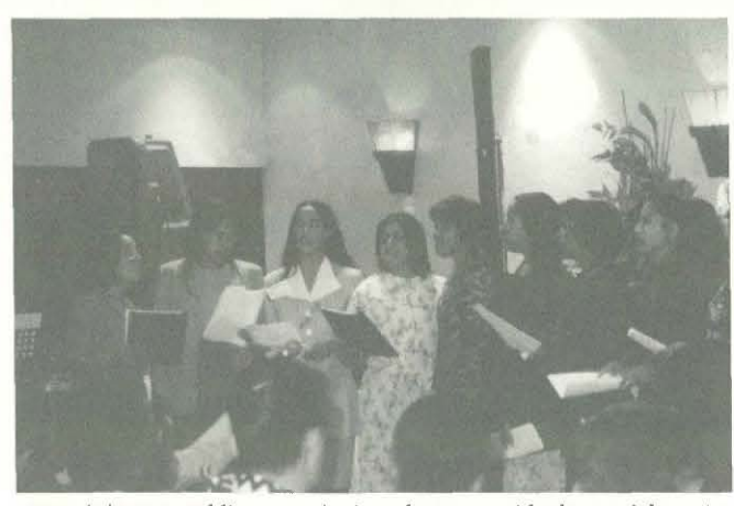
Dominican Republic pastors' wives chorus provide the special music