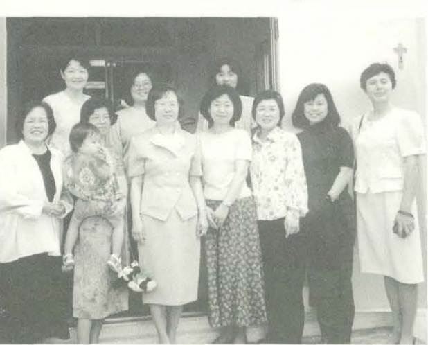
Okinawa Shepherdess Seminar