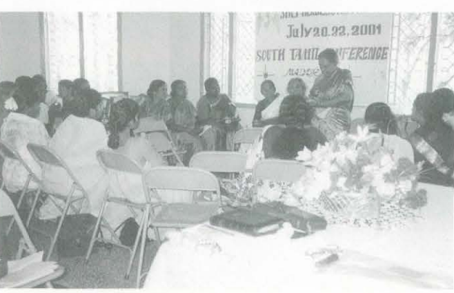
Group discussion at Shepherdess Retreat in South Tamil Conference, India