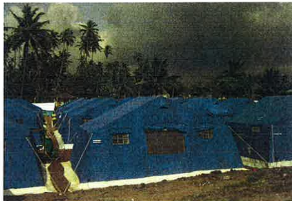
Temporary housing for tsunami victims