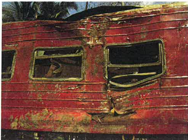
Destruction caused by the tsunami