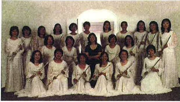
The Eunbitsori Flute Band

✿ The West Central Korean Conference Shepherdess Choir was organized in 2001 and has done many concerts, church dedication services, and performances for patients in Adventist hospitals.