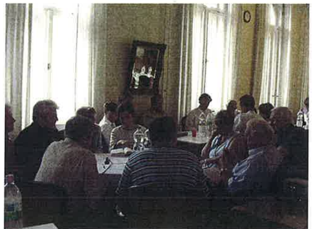
Lively discussion groups