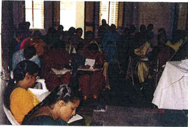
Searching the scriptures at the Nellore Shepherdess meetings