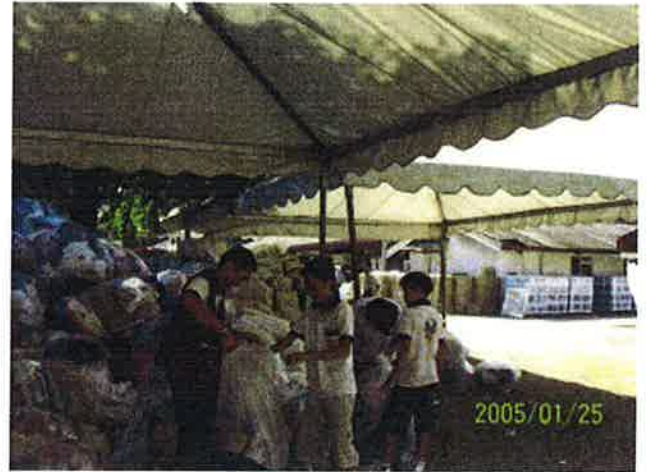
Pathfinders preparing clothes