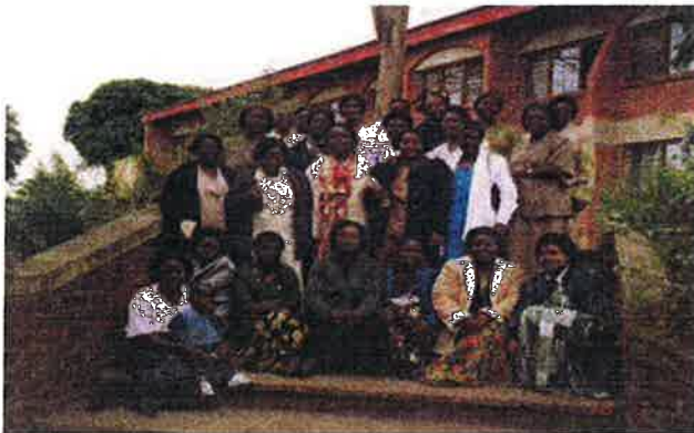
Malawi Union Shepherdess Executive Committee members from South, Central, North Malawi Fields and the Union office who participated in the Leadership Training Seminar in Lilongwe.

✿ In the Nyabira community, the shepherdesses had a kitchen program for the needy and then a three-week evangelistic effort by a local pastor. The event was covered by the local media and broadcast on national TV.