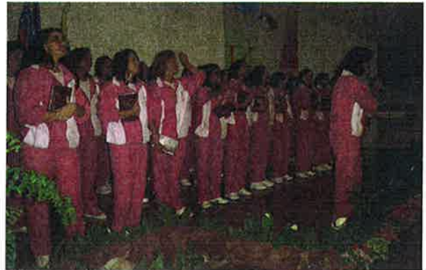
Conference uniformed pastors' wives

✿ In August 2004 SAD and the North Brazil Union held a Shepherdess Retreat in Belem. Pictures highlighting this event are below and on the following page: