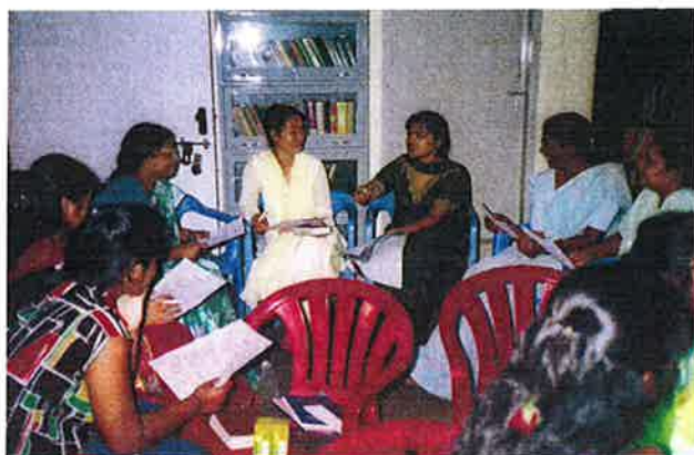
Group discussions at Bangalore meetings