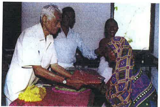
Widow clothing distribution. The first Adventist Church member giving a sari to an elderly widow.