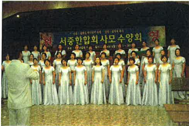
The West Central Korean Conference Shepherdess Choir

✿ The West Central Korean Conference Shepherdess Choir was organized in 2001 and has done many concerts, church dedication services, and performances for patients in Adventist hospitals.