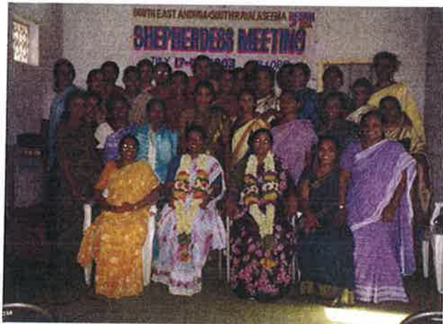
Group photo in Nellore