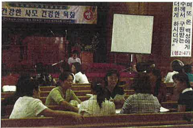
Group discussion at the Shepherdess Retreat in Korea