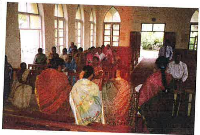
North Andhra Section Shepherdess meetings