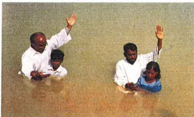
Baptisms from the meetings