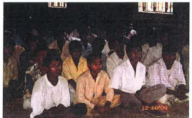
The men are taught separately