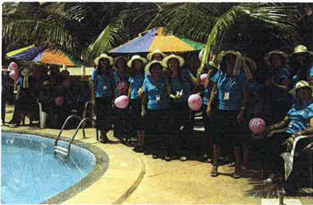
Shepherdesses at closing ceremonies