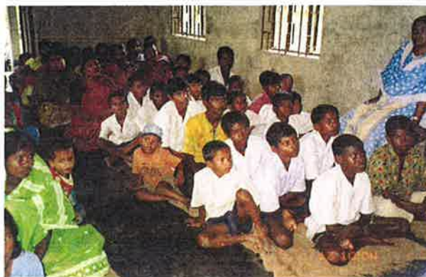
Young and old learn of Jesus