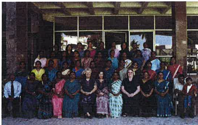
Shepherdess meeting in Bangalore, January 2004

enjoyed group discussion and searching the scriptures. They also rededicated their lives to serve the Lord faithfully and fruitfully.