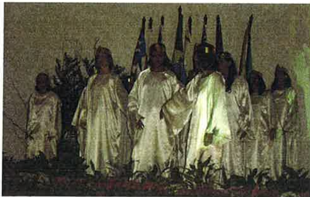
A memorable play