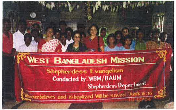
Opening of the meetings