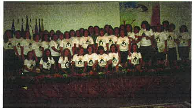
Conference uniformed pastors' wives