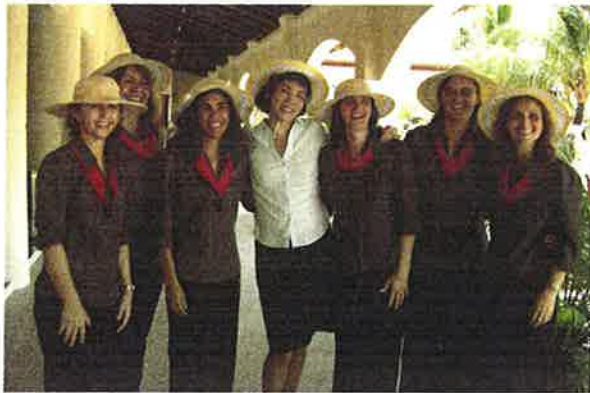
Union AFAM ladies