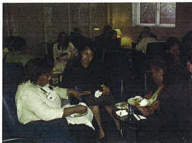
Ladies enjoy a meal together