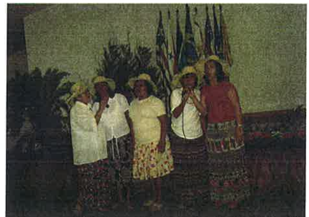
Cultural music was enjoyed by all