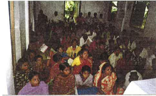
The church is full in one location