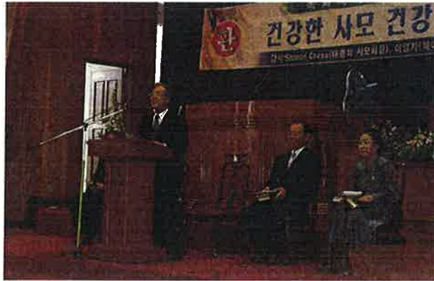
Shepherdess Retreat in Korea