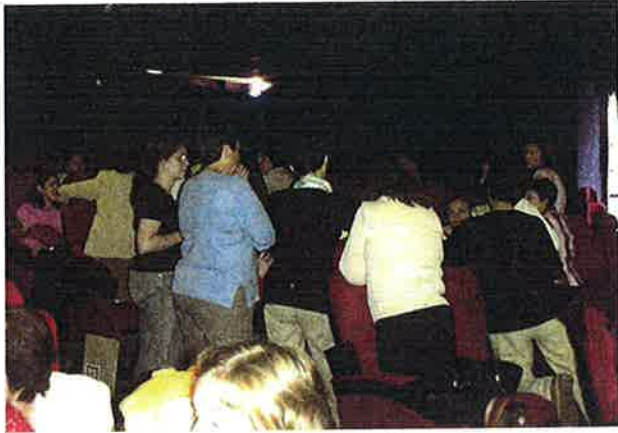
Lively discussion in small groups