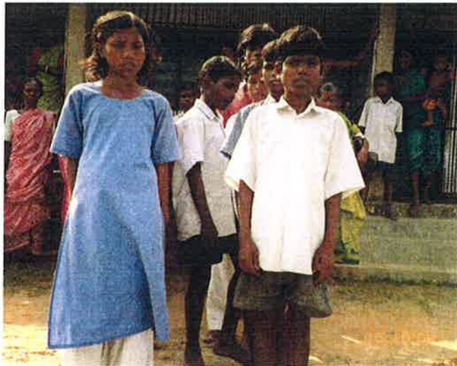
Children attend and are involved