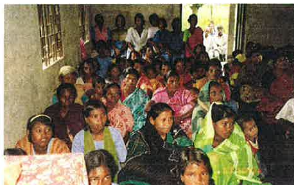
A packed house listens intently