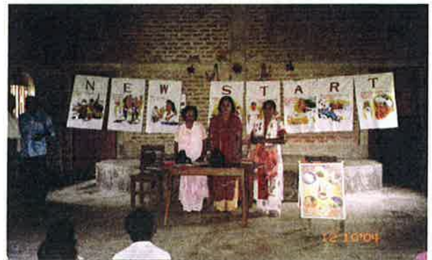
A new start for many