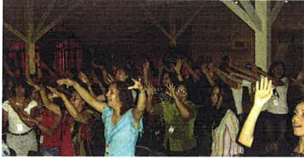
During each program there was an exercise time for the ladies