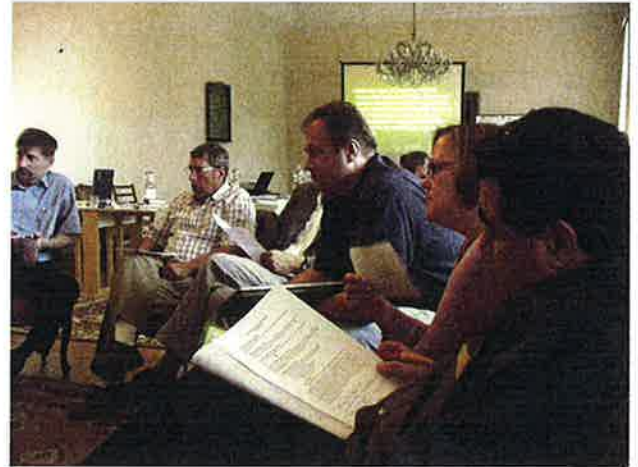
Participants review and plan their ministerial documents