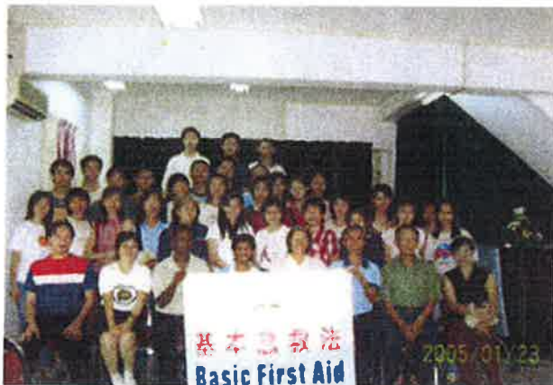
Graduates of the First Aid Course