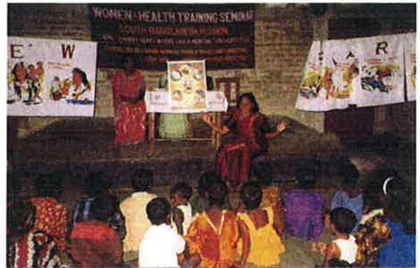
Women and children are educated