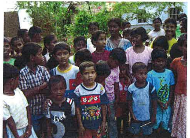
Children, victims of the tsunami, waiting for food and clothes