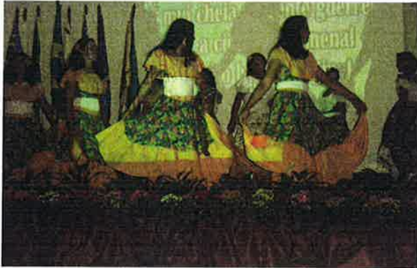
Beautiful cultural entertainment