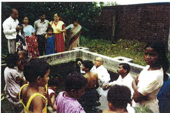
A baptism inside the campus of WBM