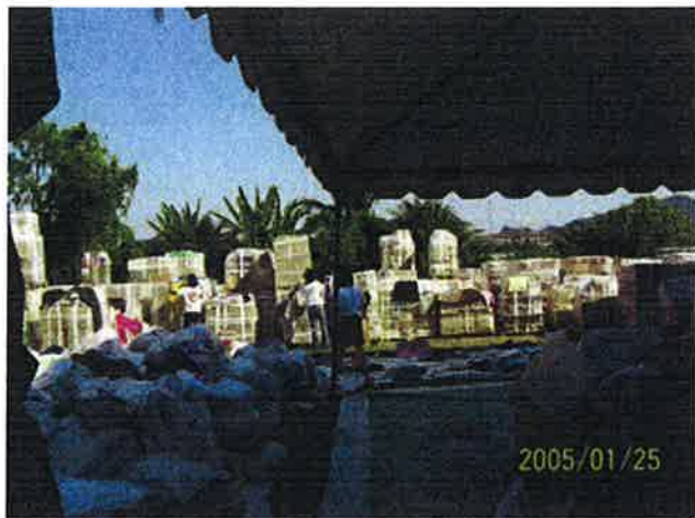
Clothing awaiting distribution to tsunami victims