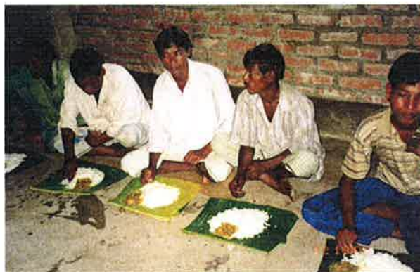
Lunch is served