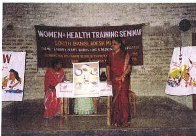
Health training is incorporated