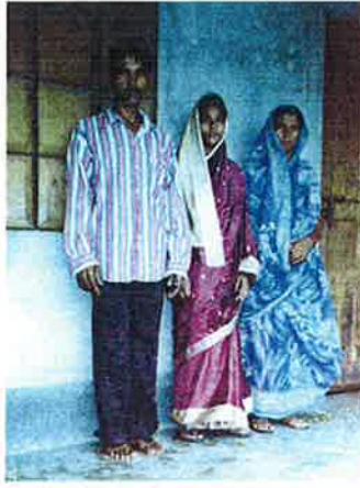
Left—The husband and wife who were baptized with the pastor's wife (in a blue sari) who prepared them