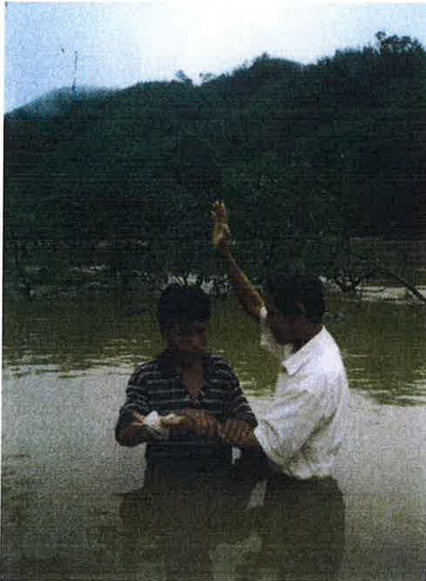
Secret Myanmar baptism