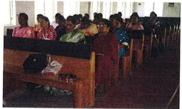
Shepherdesses listening to the presentation