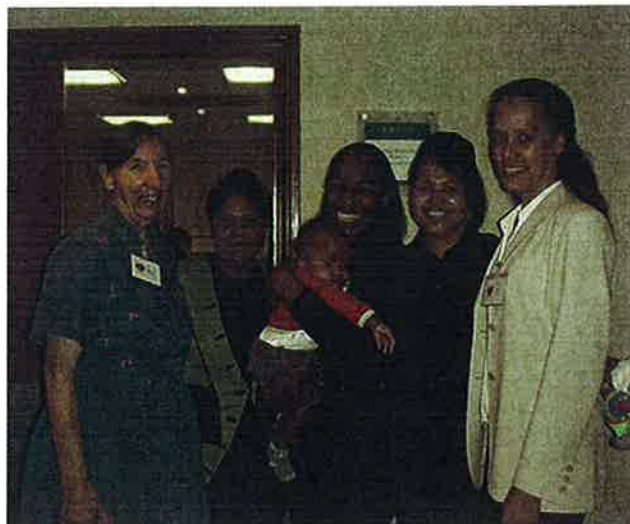
South England Conference pastors' wives who attended the Retreat

✿ The South England Conference held a retreat for pastors' wives in November 2004. Highlights of the week included: