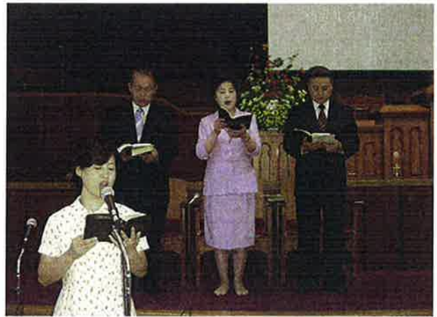
Song service at Shepherdess Retreat in Korea