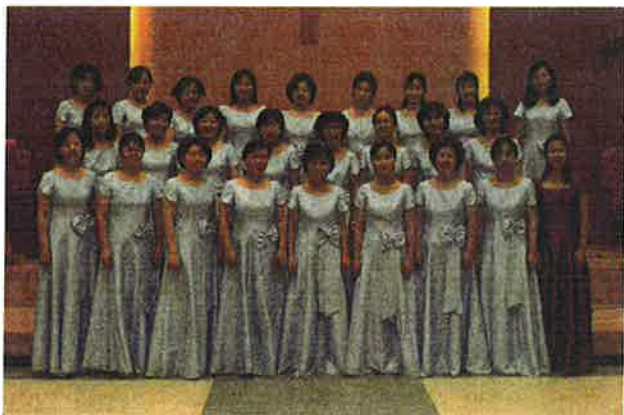
The West Central Korean Conference Shepherdess Choir