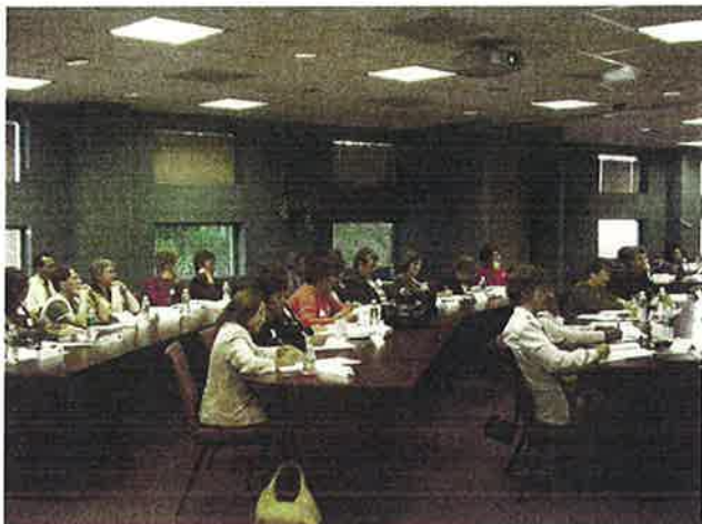
Ladies enjoy the presentation