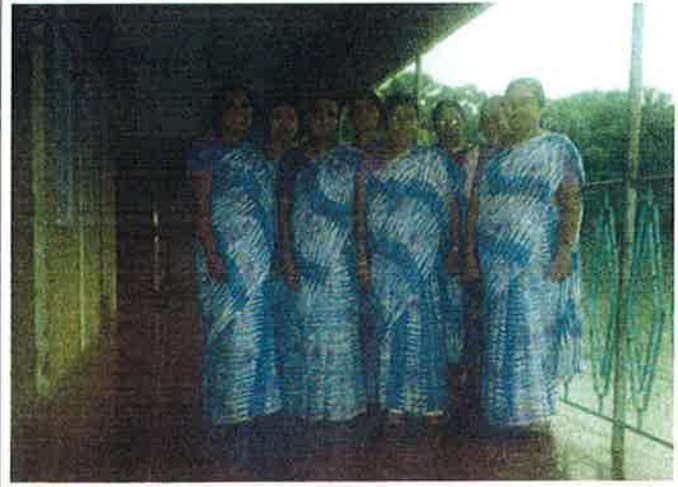
All the shepherdesses present and ready to work