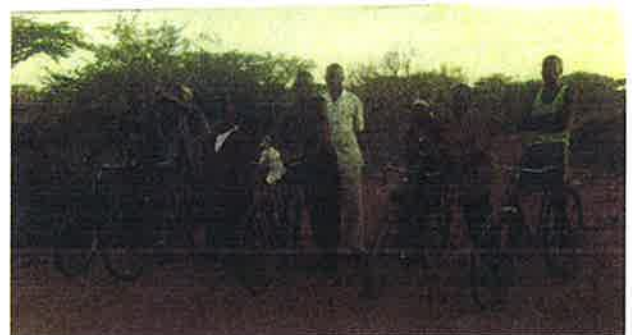
Going back to the main road