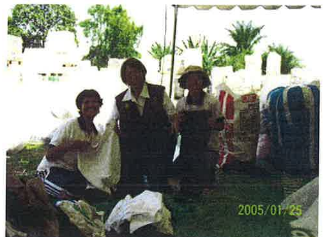
Some of the ladies helping with clothing distribution