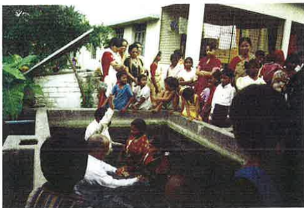
Baptism in the West Bangladesh Mission