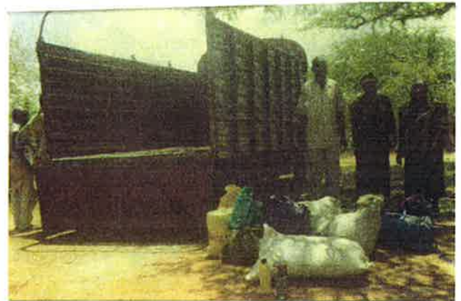
The arrival of the shepherdesses