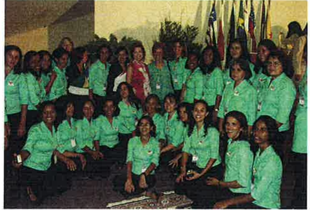
Local conference AFAM group