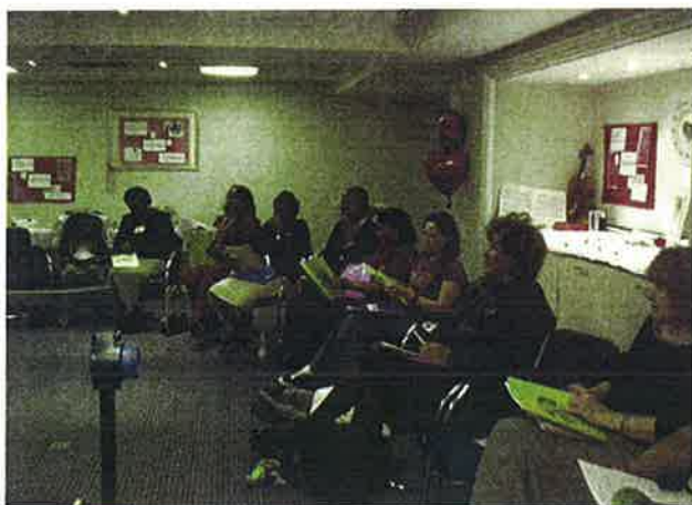
Ladies enjoy a seminar