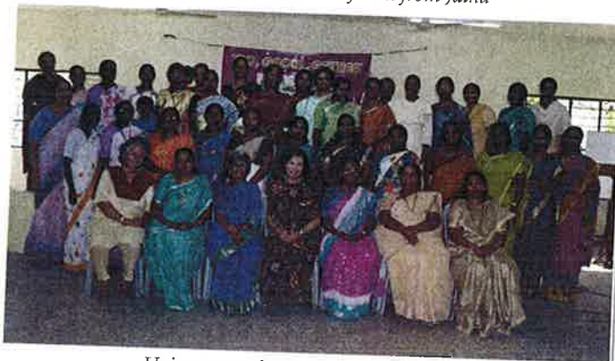
Union pastors' wives' formal portrait