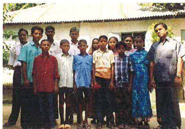
A group of baptismal candidates