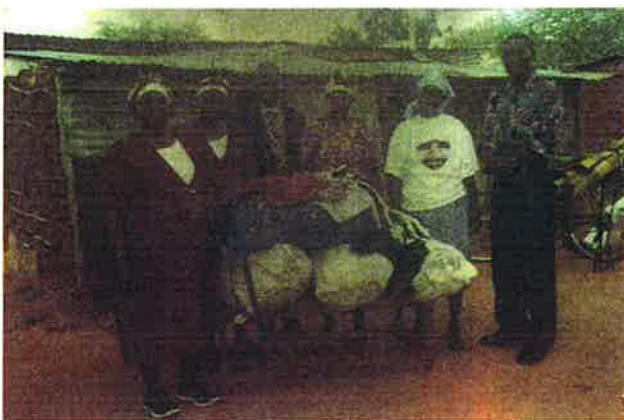
Shepherdesses with bags of clothes for distribution