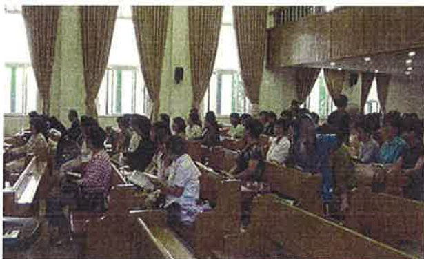
Listening to a presentation at the Shepherdess Retreat in Korea