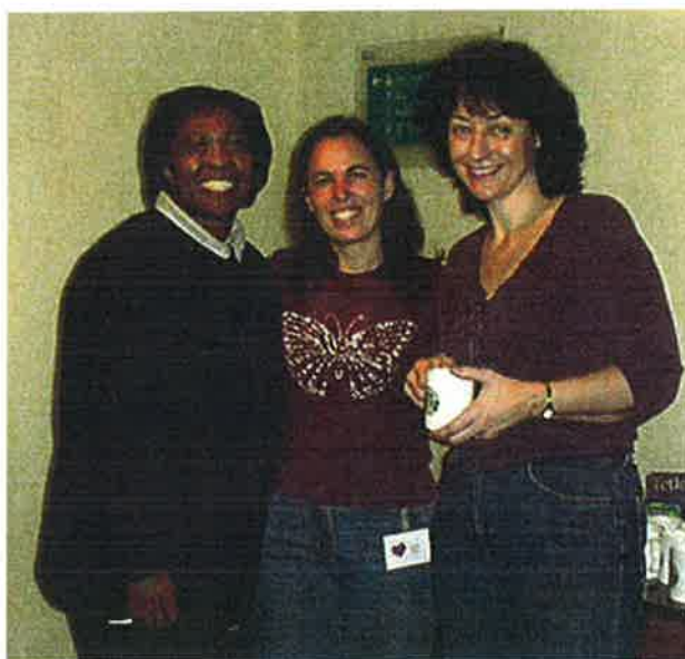
Fellowship was a highlight at the South England Retreat