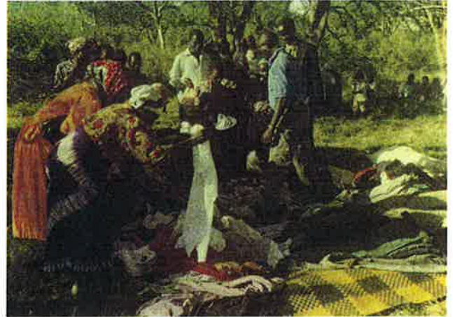
Shepherdesses distributing clothes

Photos on this page are from the Coast Field Shepherdesses as they travel to Kilibasi.