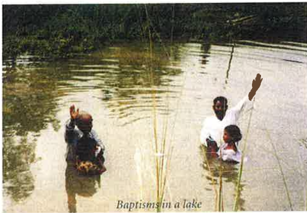
Baptisms in a lake