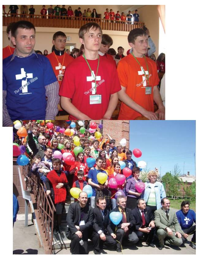
Pastors' kids from Caucasus Union Mission

Recently the pastors' kids from Caucasus Union Mission met in Taganrog City for a congress. The motto was "I Need You," and about 130 pastors' kids participated in the meetings. They were a cheerful group who enjoyed working in ministry with their parents. At the end of the congress two young people were baptized. Following are pictures from this event: