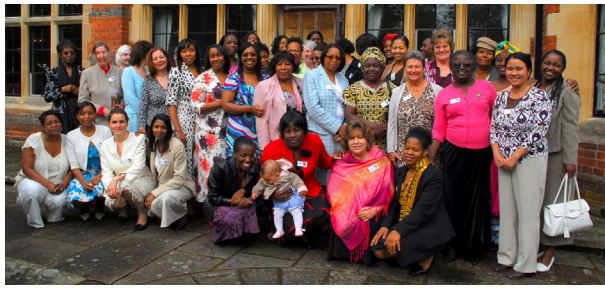
South England Conference group