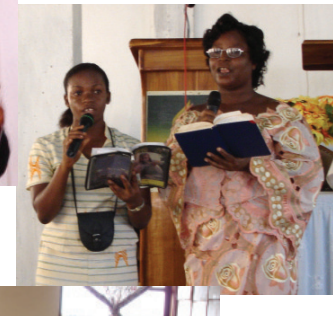
The Shepherdess Coordinator for Togo Mission presents a special number with her daughter (below)