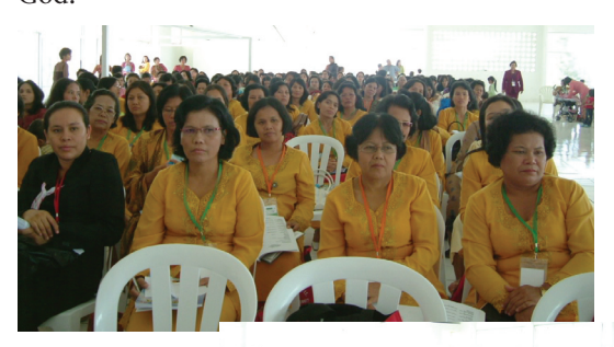
Shepherdesses from each mission/ conference in their official uniforms

During the closing program on Sabbath afternoon, all delegates presented the work developments in their field/mission/conference. The highlight of the afternoon was the presentation of ministerial pins to all pastors. Asked about their impressions of the event, some participants said it was "memorable and inspiring to be together with all pastors and shepherdesses, to learn together and fellowship together to enhance the quality of service for God."