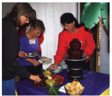
A chocolate fountain added a special touch to dessert.