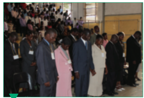
Fourteen pastors were ordained in Mozambique.