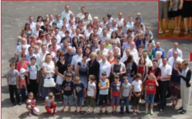
Ministerial family retreat held in Lviv, Ukraine.

A prayer congress in Minsk, Belarus, included three unforgettable days filled with unity, spiritual enthusiasm, and the power of the Holy Spirit. Participants united in prayer, shared their requests, and saw prayers answered.