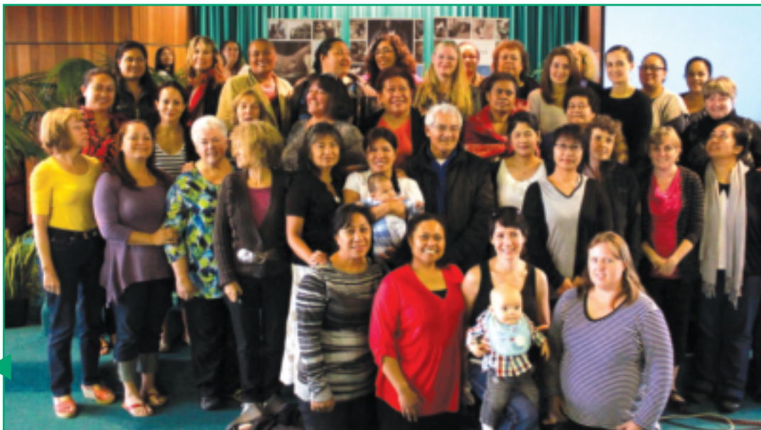
Pastors' spouses in New Zealand.

In April 2013 New Zealand held a ministerial couples retreat. They spent the time together in training seminars, fellowship, and prayer.