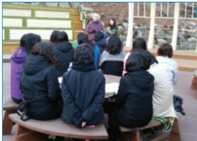
Leaders from West Central Korean Conference met together in March to organize their mission.