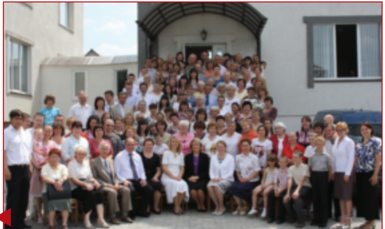
Group in Belarus meeting for a prayer conference.

Saturday night featured an all-night prayer session, followed by a prayer breakfast. Participants shared prayer concepts they had learned in their own churches and conferences.