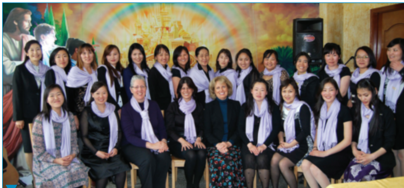
Mongolian pastors' spouses.