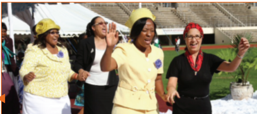
Regional and world women's ministries leaders are pictured at meetings in South Africa.