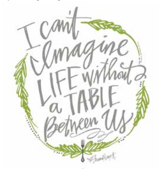
How about you?

if he was killed in a car accident? What if he got terminally ill? What if something else took him away from me? How would I go on? I didn't want to imagine life without him across the breakfast table every morning. Even now, years down the road, after plenty of ups and downs, my pervading thought is: